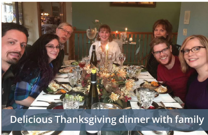
Delicious Thanksgiving dinner with family