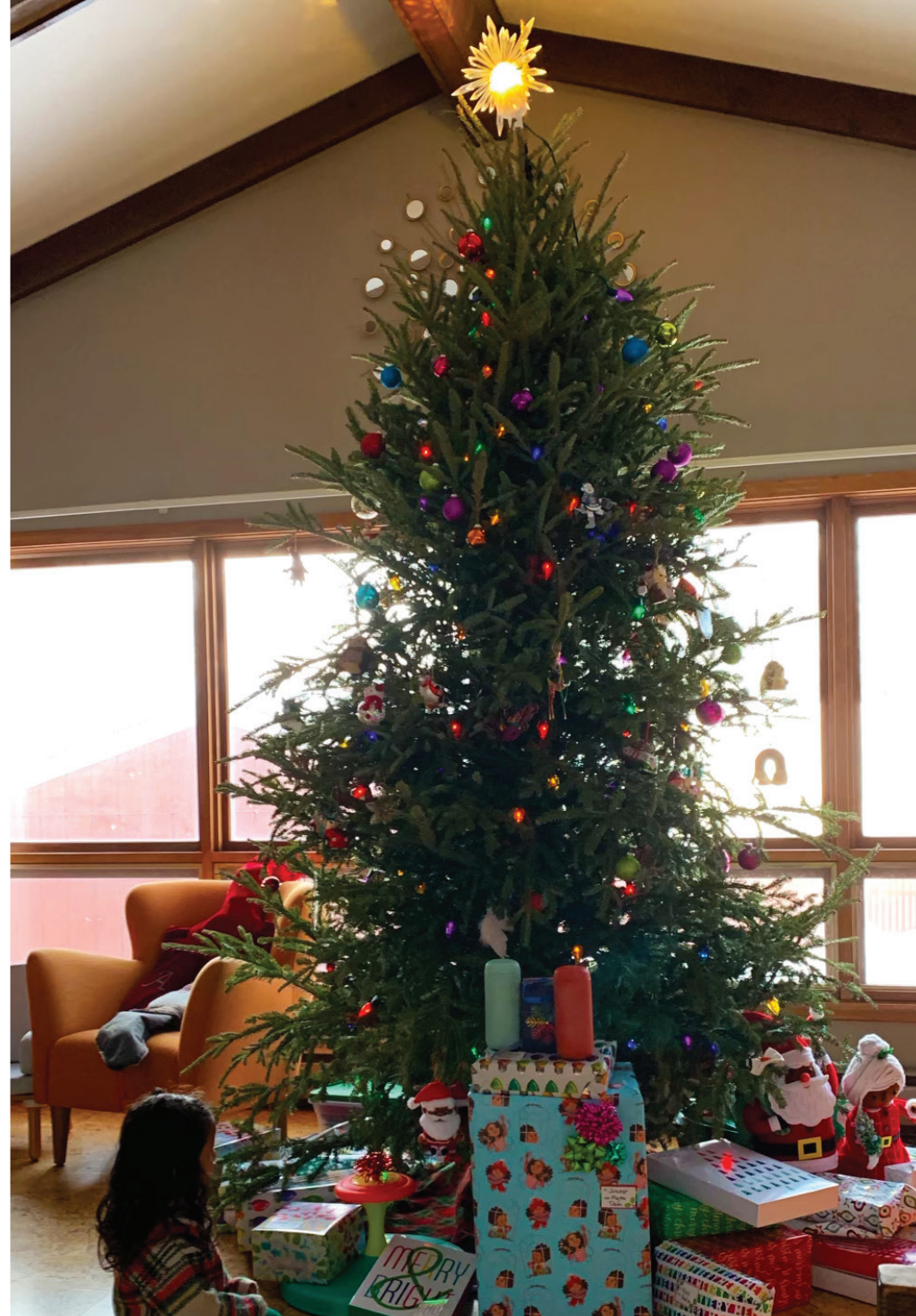
Our very tall Christmas Tree to fill up these very tall ceilings - always fills our home with the best holiday smell of all.