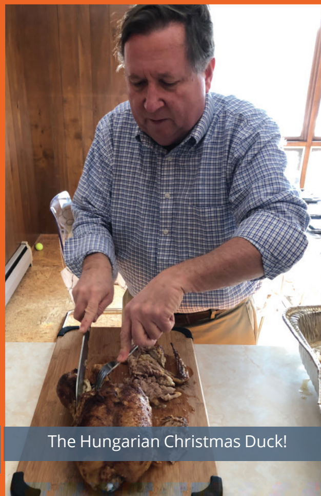
The Hungarian Christmas Duck!