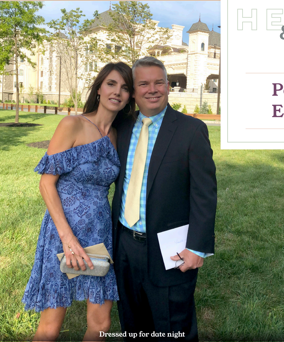
Dressed up for date night