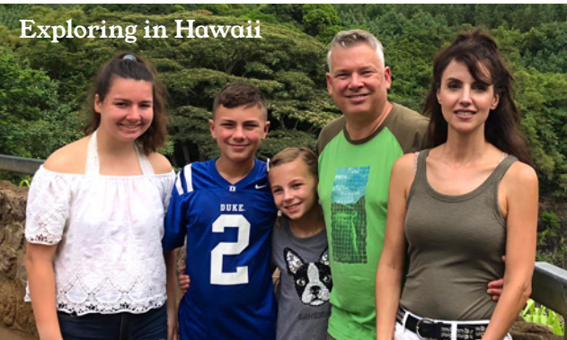
Exploring in Hawaii