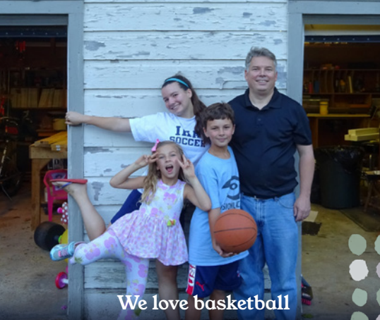
We love basketball