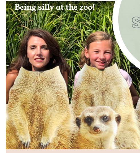
Being silly at the zoo!