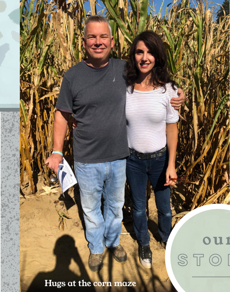
Hugs at the corn maze

We promise to unconditionally love and cherish your baby with all of our hearts.