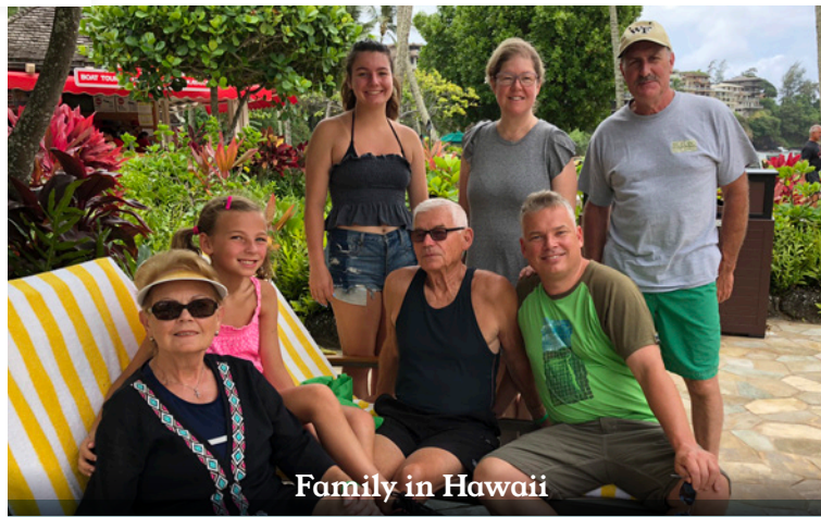
Family in Hawaii

Birthday parties are a big celebration for us. We have 2 birthday parties for each of our kids every year. We have one party with all of our family and then another party with our kid's friends. We have had a big bouncy house in our backyard, went to an indoor rock-climbing party place, and had a party at a gymnastics school with their friends.