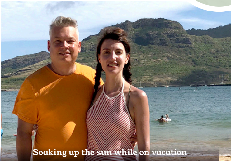
Soaking up the sun while on vacation

We always wanted to add to our family through adoption. The kids are excited as well to have a younger sibling. We have been touched by adoption in our lives and look forward to this amazing adventure. They are already making plans to teach their new sibling how to play soccer and basketball and how to make sandcastles at the beach.