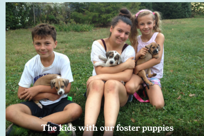
The kids with our foster puppies

We frequently see both sides of our extended families. Both of our families are excited about our plans to adopt and can't wait to have another baby in the family to love.