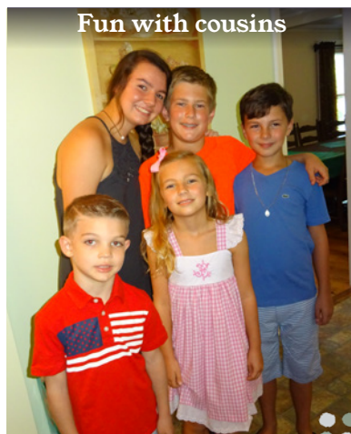
Fun with cousins

We frequently see both sides of our extended families. Both of our families are excited about our plans to adopt and can't wait to have another baby in the family to love.