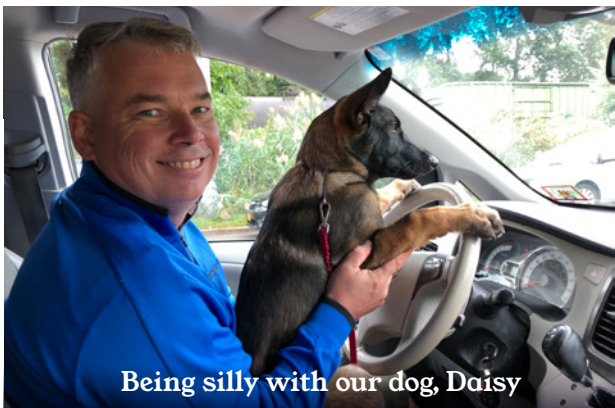
Being silly with our dog, Daisy