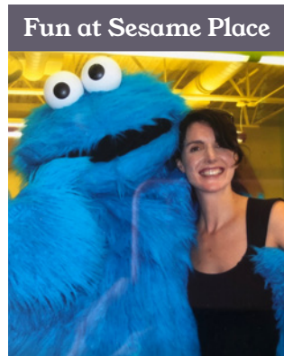
Fun at Sesame Place