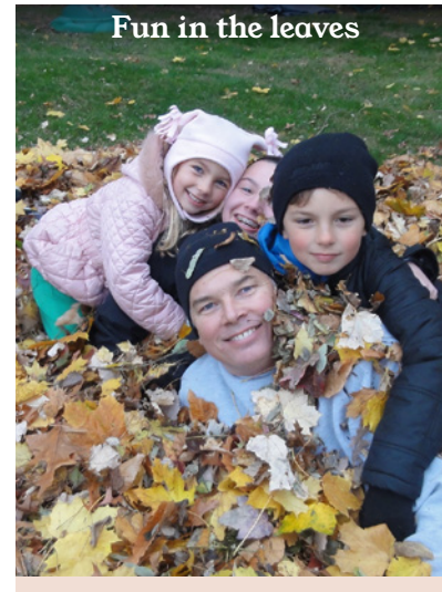
Fun in the leaves