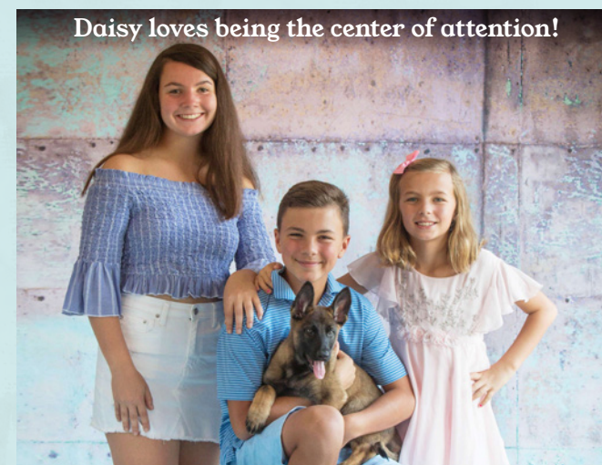
Daisy loves being the center of attention!