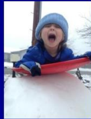
Winter fun: Ice skating, skiing, sledding