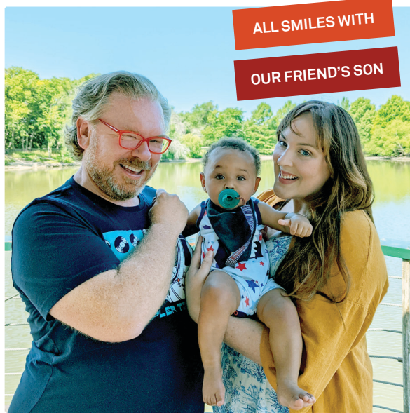
ALL SMILES WITH OUR FRIEND'S SON