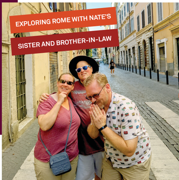
EXPLORING ROME WITH NATE'S SISTER AND BROTHER-IN-LAW