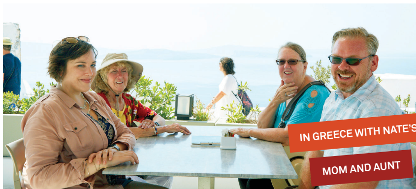
IN GREECE WITH NATE'S MOM AND AUNT

★ We have a wonderful, close-knit family